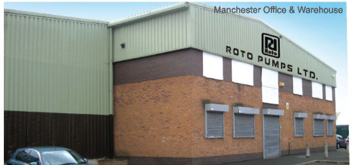
Manchester Office & Warehouse