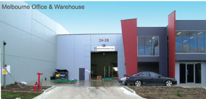
Melbourne Office & Warehouse