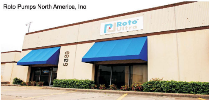
Roto Pumps North America, Inc