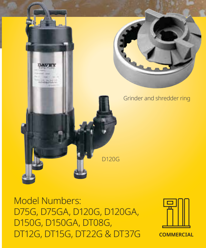
Grinder and shredder ring