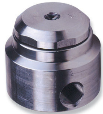
Corrosion Resistant Construction (for Illustration Only)