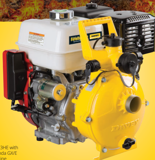
5113HE with Honda GX/E Engine